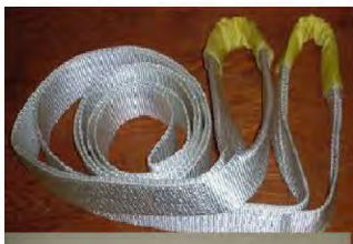
The small 4 X4 30.000 Lb Max 15.000 WLL. 3" X 20' Loop to Loop