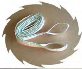
1" x 15' Loop To Loop