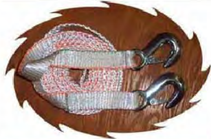
The RV. Tow-line with 2 Hooks 2" x 15'