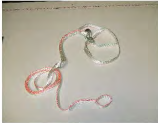
The RV. Tow -Line with 1 hook & loop to rap Around & loop to pull with 1" x 15'