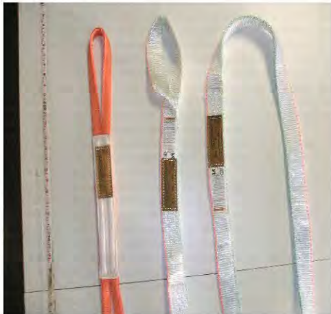
RE EE EN