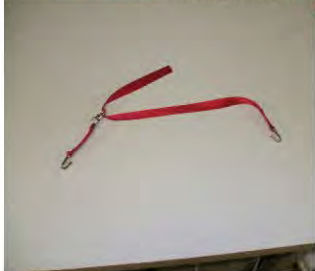
Rv .rack Tie down c/w 2 hooks & Quick Clip 1" X 3'